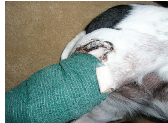
Beau's bandaged leg.

She really is a little trooper and a deserving receiver of Weston Creek Veterinary Hospitals' first Purple Heart Award for 2006!