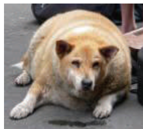
A couple of examples of overweight/obese pets.